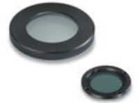
Simple polarising attachment